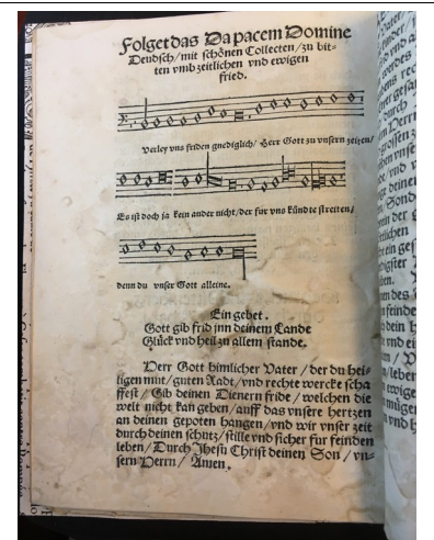
6. Martin Luther: Hymn for peace (Verleih uns Frieden), 1537