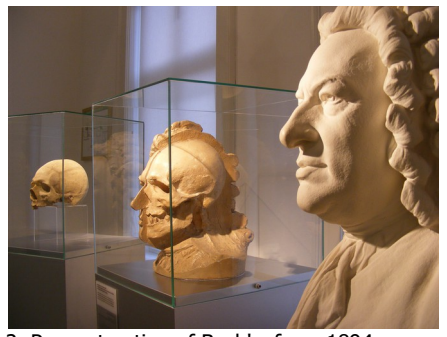
2. Reconstruction of Bach's face, 1894