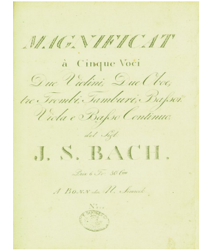
4. J. S. Bach: Magnificat. First print, 1811