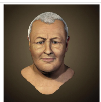
1. Reconstruction of Bach's face, 2008

https://www.dropbox.com/sh/39sz4q2oubg0nxt/AABk-hA1hQEDyGRKIwkG8NZca?dl=1