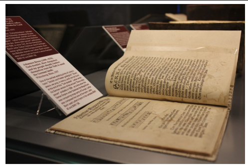
5. Martin Luther: Hymn for peace (Verleih uns Frieden), 1537